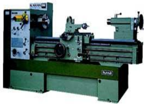
Fig 1. Conventional HMT Lathe

Conventional HMT lathe machine has been used for the experiment having different parameter. Different range of speed can be chosen in machine by shifting the gears according to required speed. The Experiment has been conducted by Turning of mild steel, using HSS Tool and MINITAB 17.0 software (TRIAL) is used for optimisation. Surface roughness is measured by surface roughness tester.